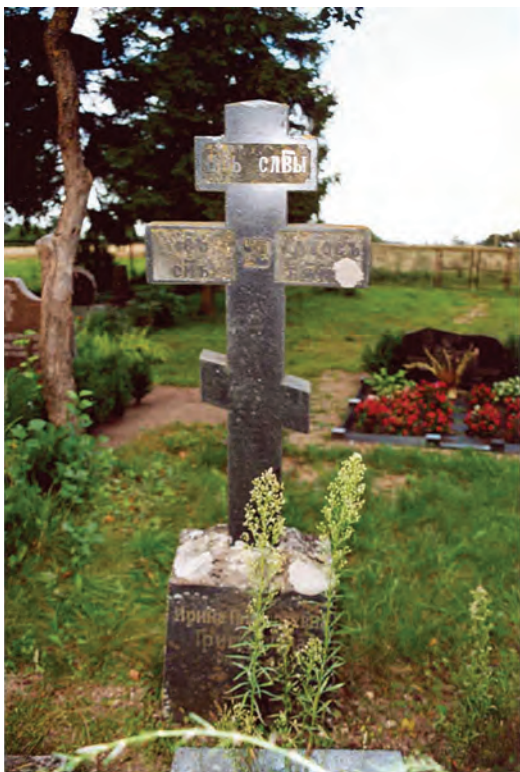
Fig. 33. Vegeriai, Gravestone for Irina Grichenkova (d. 1911).