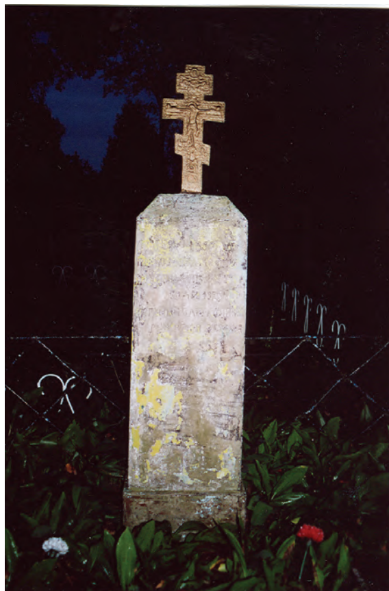
Fig. 5. Nekrūnai, Gravestone of a teacher killed by Lithuanian partisans in 1947.