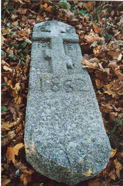
Fig. 80. Vėzhiškės, Monument dated 1862.