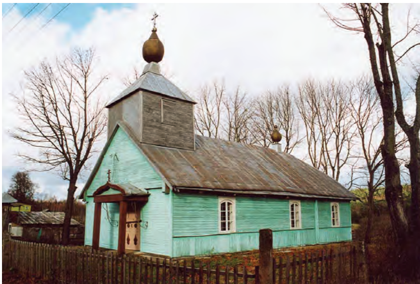
Fig. 73. Daniliškės, Old Believer church.