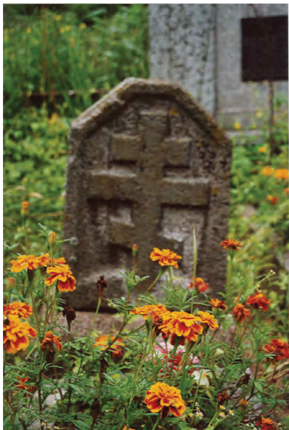
Fig. 10. Varpiai, Old unknown gravestone in cemetery.