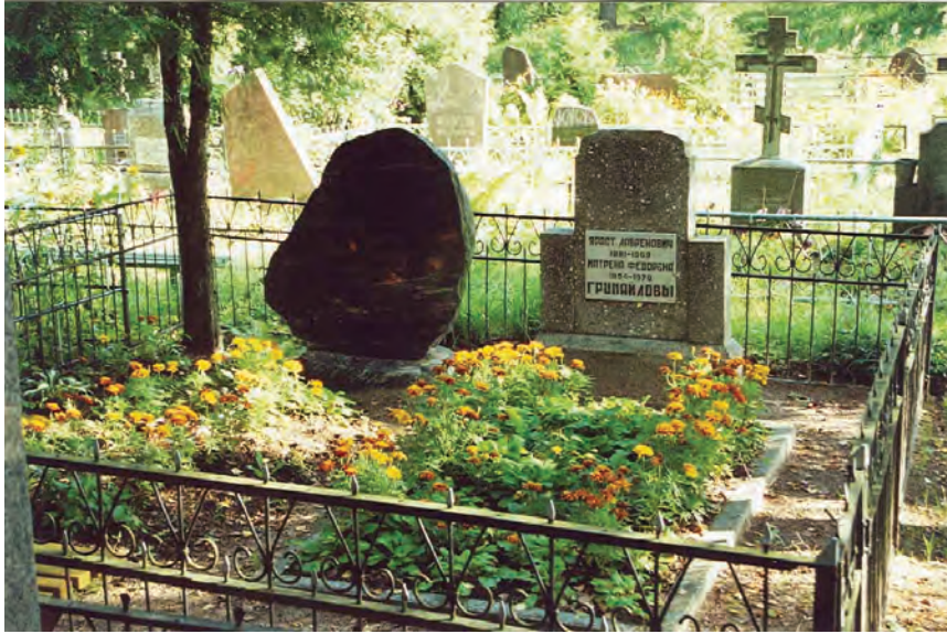
Fig. 48. Špuli, Graves in the southeastern part of cemetery.