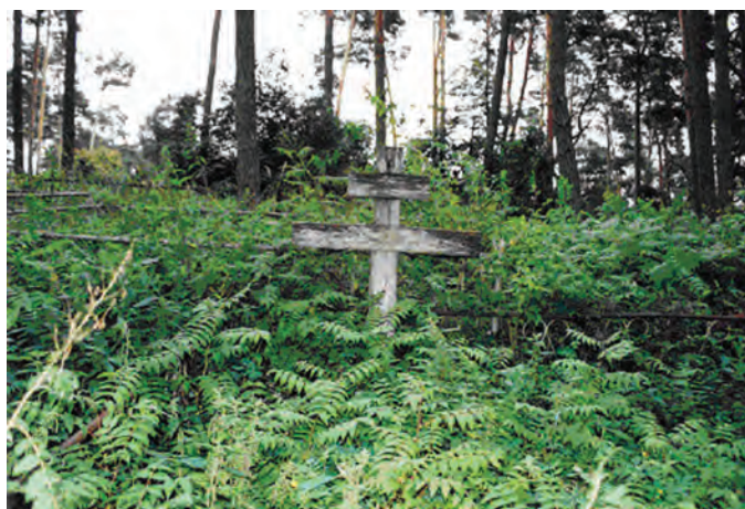
Fig. 11. Varpiai, Overgrown grave marker in cemetery.