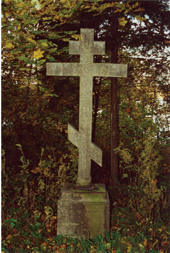
Fig. 2. Example of an eight-final cross.

Inactive Sites: Places where, in the case of churches or parishes, Old Believer religious services were conducted as recently as the second half of the 20th century but no longer were conducted at the time of the survey or, in the case of cemeteries, where new burials were no longer being made.