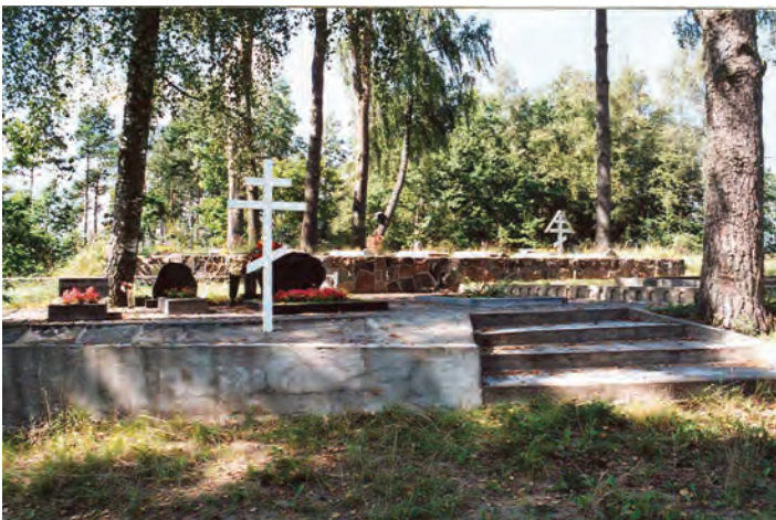
Fig. 38. Kontaučiai, Cemetery. Monument to victims of the Lithuanian partisan war.