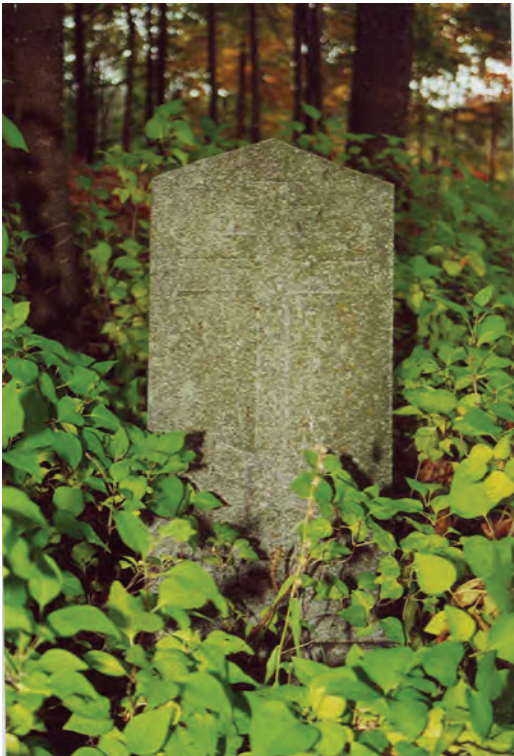
Fig. 55. Samaniai (Barauka), Gravestone, datable to 1839.