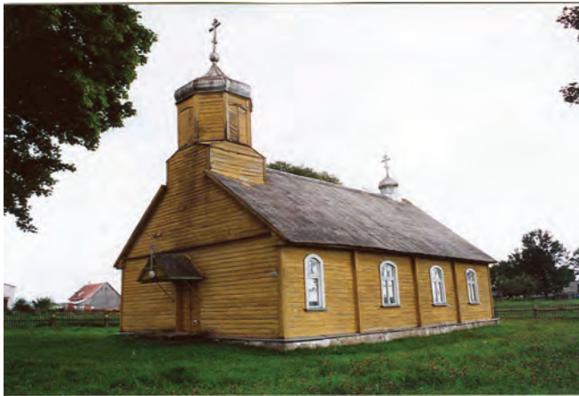
Fig. 28. Smilgiai, Former Old Believer church.