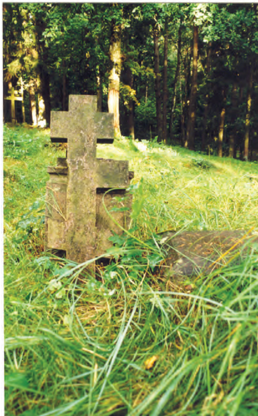
Fig. 15. Kunigiškiai, overgrown graves in cemetery.