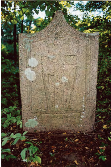
Fig 25. Stirniškės, Gravestone from 1856 in the Old Believer cemetery.