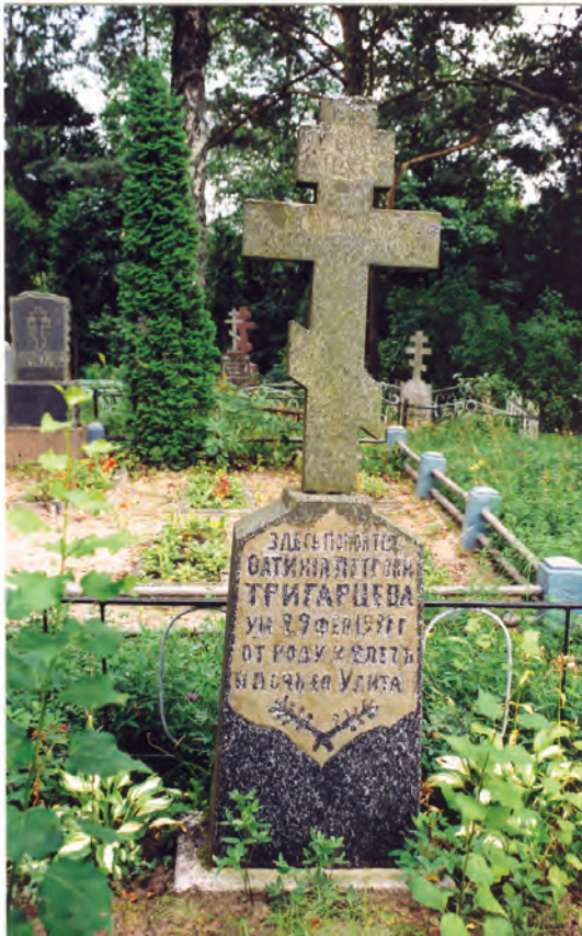
Fig. 30. Gravestone for Phatinija Trigarcėva and her daughter Ulita.