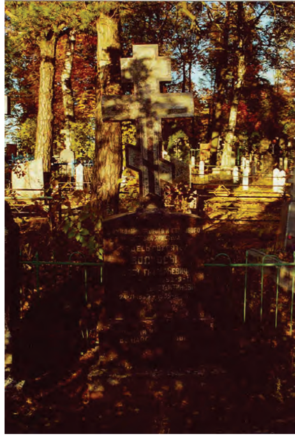
Fig. 57. Zarasai, Graves of Agej and Jekaterina Volkovy in the municipal cemetery.