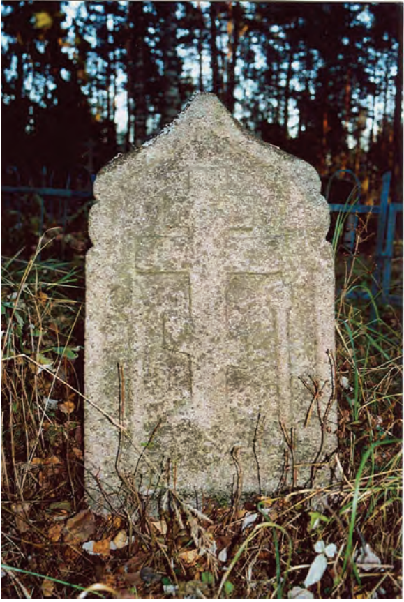
Fig. 66. Davedynai, Unknown gravestone, datable to 1861.