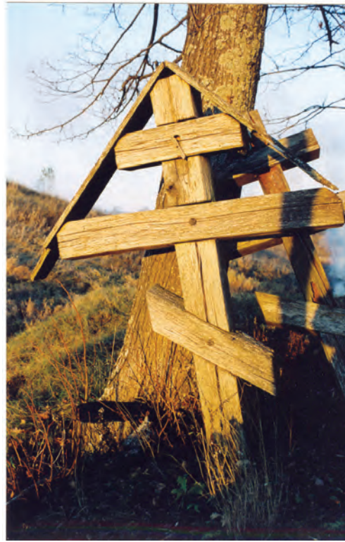
Fig. 82 Videšiūniškės, wooden, vertically-set eight-final cross in the cemetery.