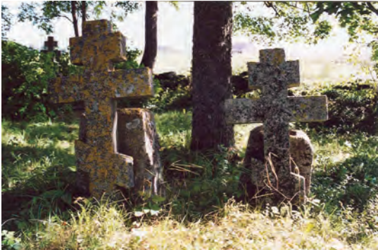
Fig. 26. Kauniškis, neglected grave-stones in the Old Believer cemetery.