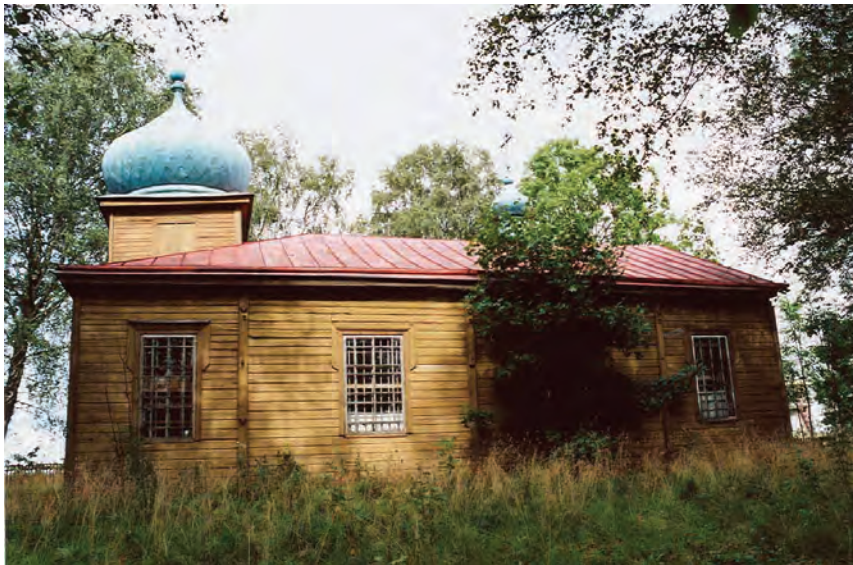
Fig. 29. Sidarai, Former Old Believer church.