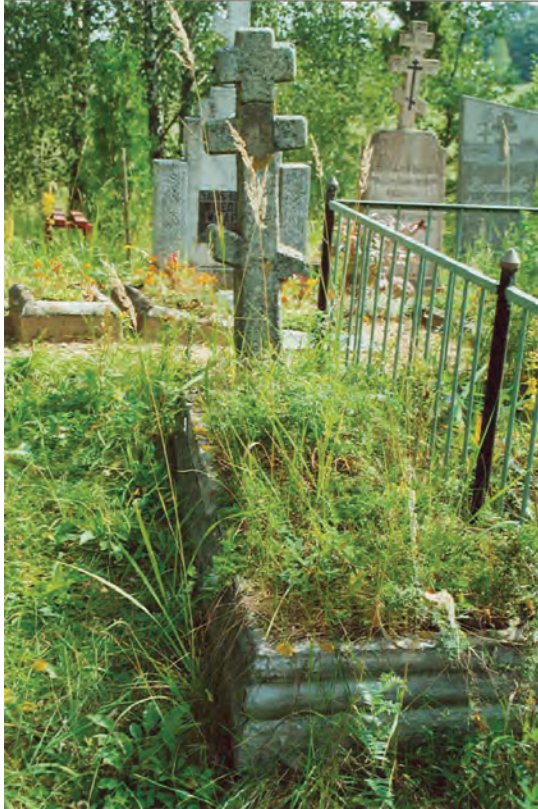
Fig. 53. Kukliai, Grave datable to 1906.