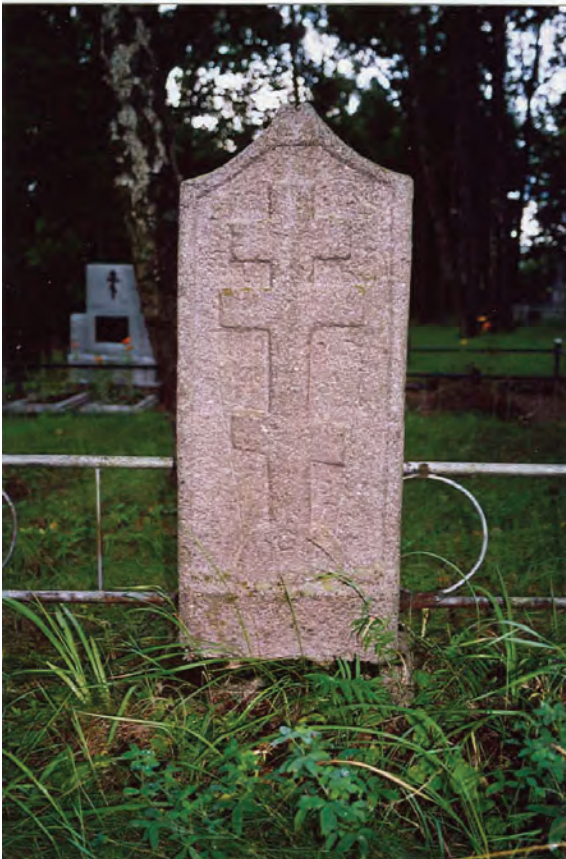
Fig. 63. Sirvydžiai, Gravestone for Aksentij Lavrenov (d. 1819).