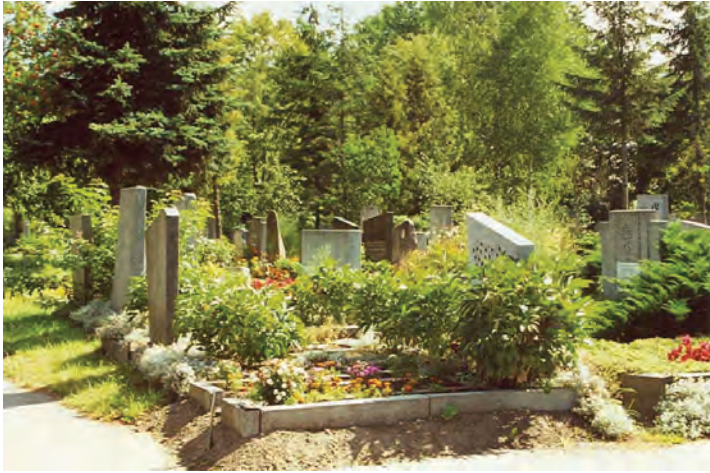
Fig. 19. Klaipėda, Old Believer section in the municipal cemetery in Joniškis