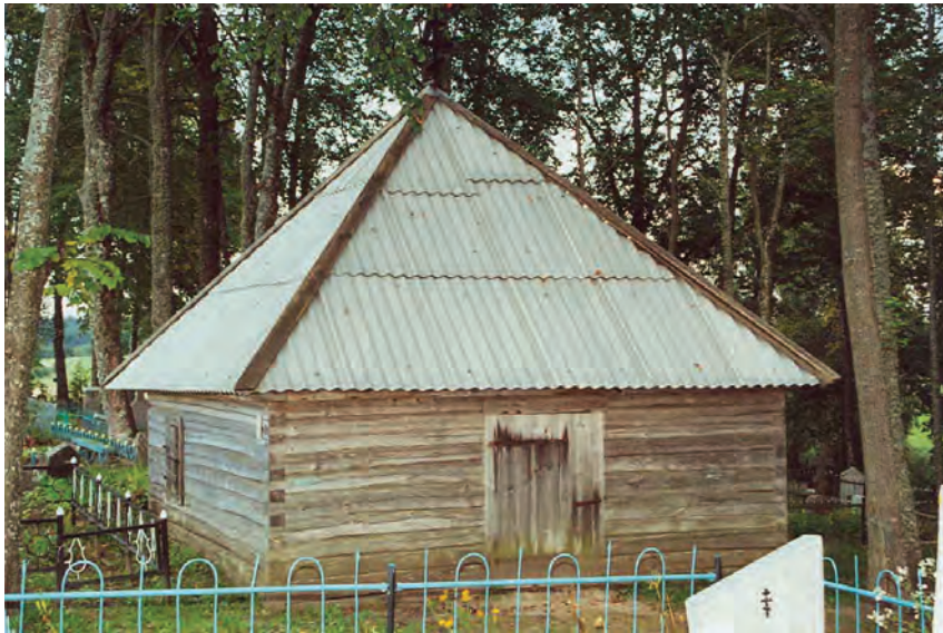
Fig. 50. Degučiai, Wooden chapel, built in 1806, at the entrance to the Old Believer cemetery.