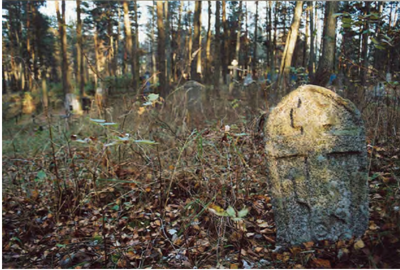
Fig. 67. Davedynai, Old grave overrun with brush.