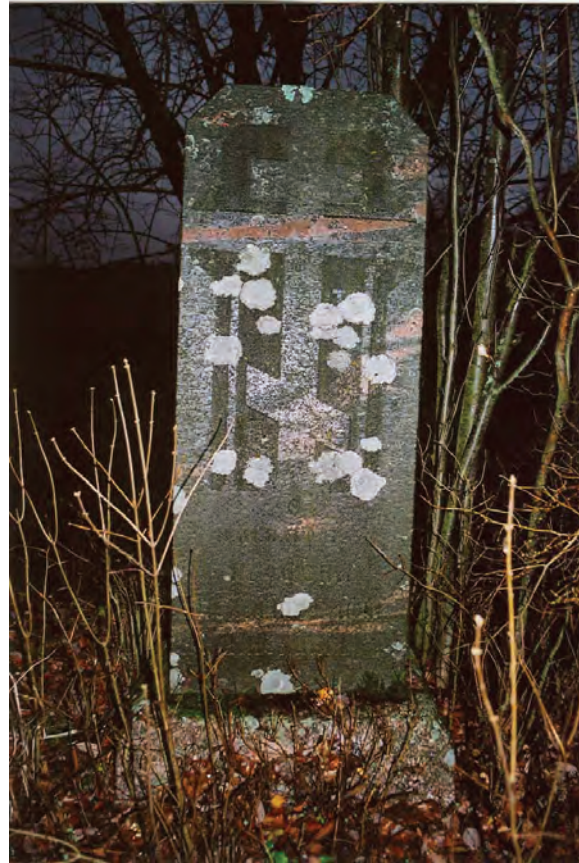
Fig. 65. Paąžuoliai, old graves overgrown with brush.