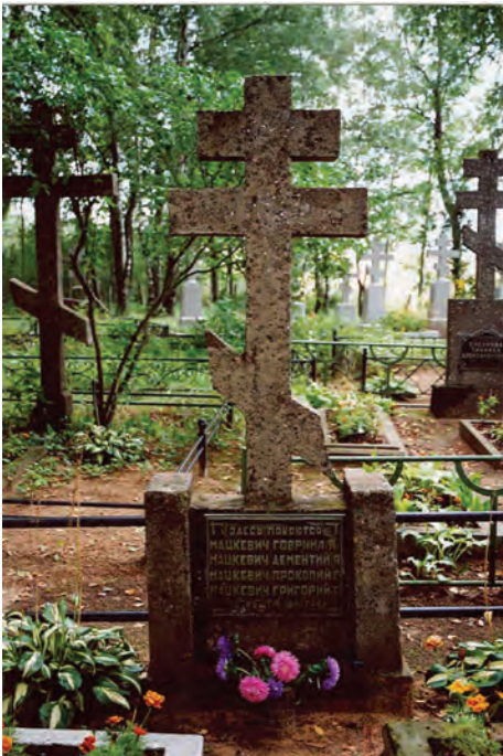
Fig. 32. Juodžiai, monument in to four victims of World War II repression.