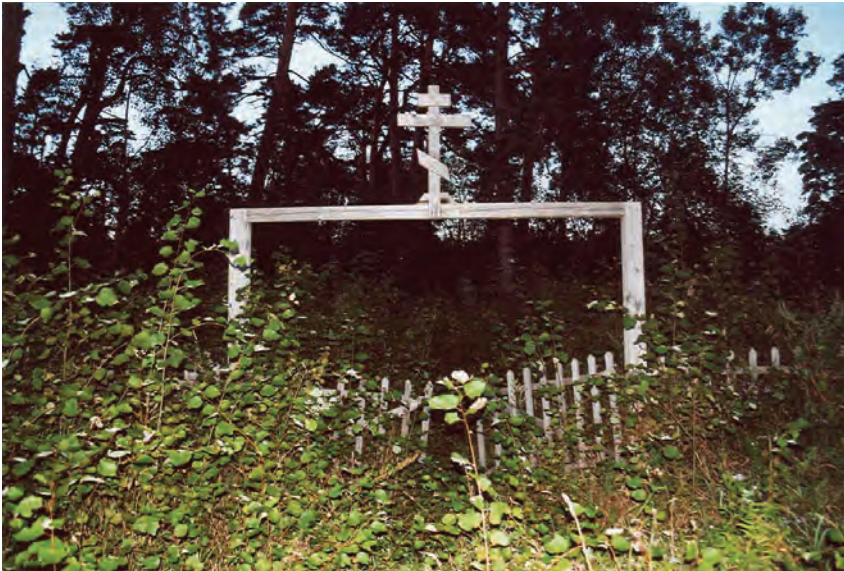
Fig. 61. Šventupis (Svetorechje), Entrance to the former Old Believer cemetery.