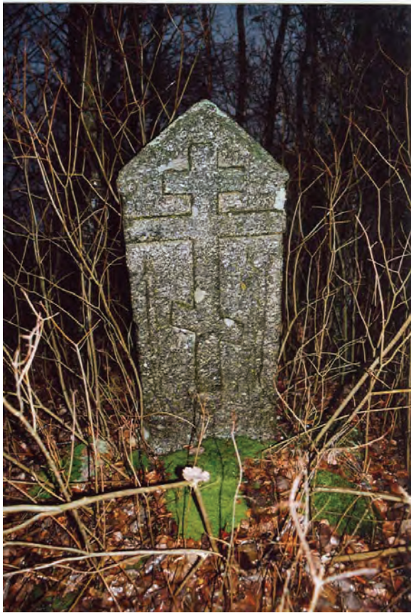
Fig. 64. Paąžuoliai, unknown gravestone, datable to 1845.