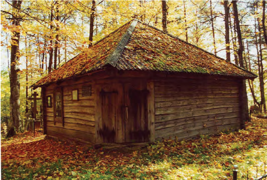
Fig. 69 Aukštakalnis, chapel, apparently founded in 1905, in the center of the Old Believer cemetery.