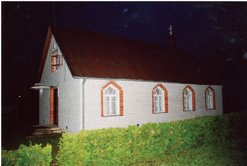
Fig. 3. Lazdijai, Old Believer Church.