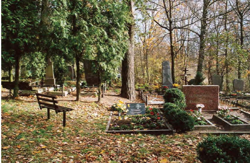
Fig. 34. Adakavas, Old Believer section of municipal cemetery.