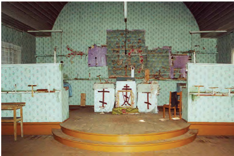
Fig. 47. Aukštakalnis, Eastern interior wall of the Old Believer church.