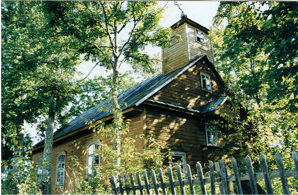
Fig. 21. Sipailiškis, Old Believer church.