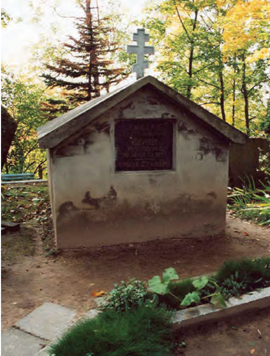
Fig. 74. Vilnius, Monument in Old Believer cemetery for Aleksej J. Novikov (d. 1828).