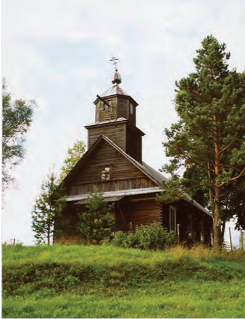
Fig. 45. Nečenai, Old Believer church.