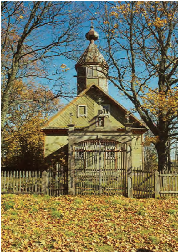
Fig. 41. Rusteikiai, Old Believer church.