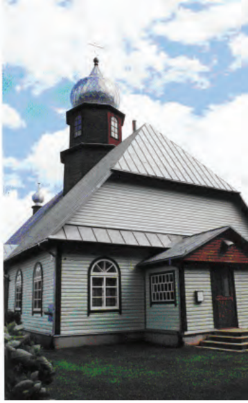
Fig. 43. Utena, Old Believer church.