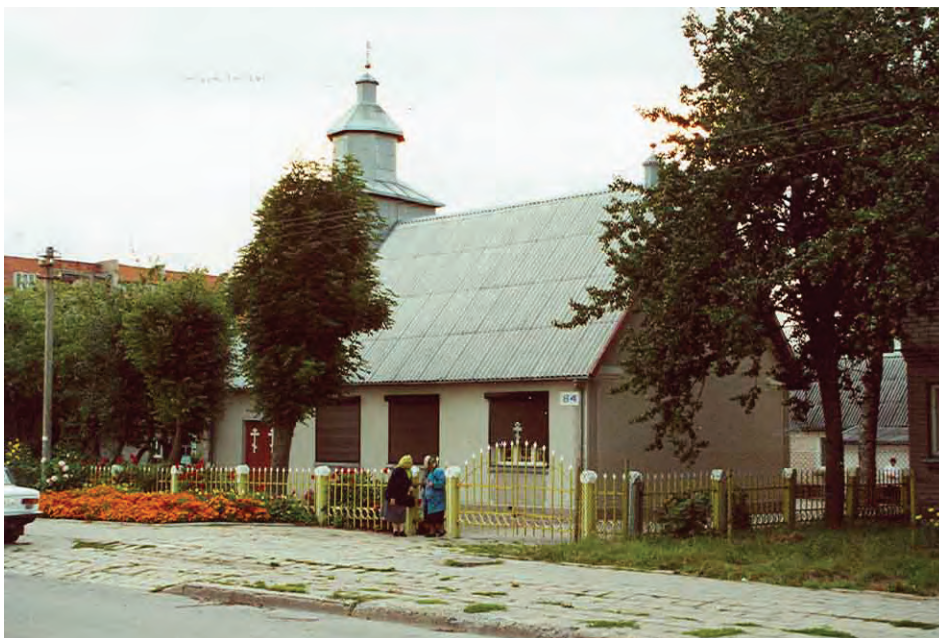
Fig. 16. Klaipėda, Old Believer church.