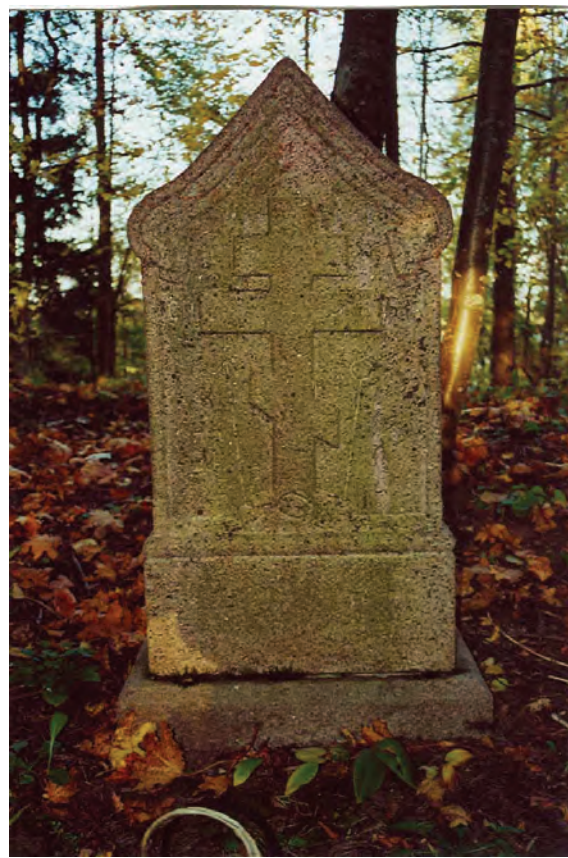
Fig. 60. Aleiniki, Mother and son's gravestone, datable to the 1870s.