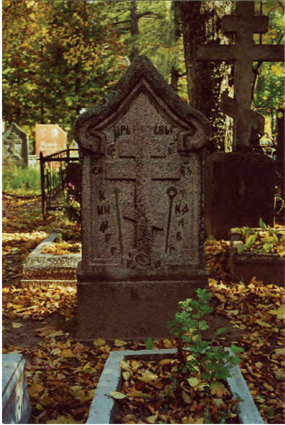
Fig. 56. Zarasai, Old monument in the municipal cemetery.