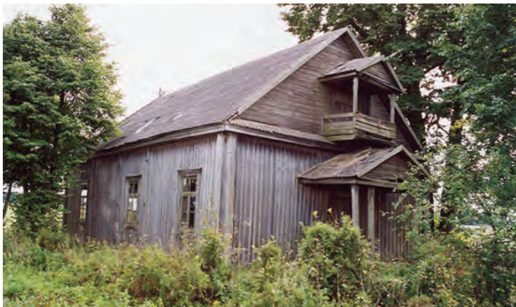
Fig. 23. Raguva, Old Believer church.