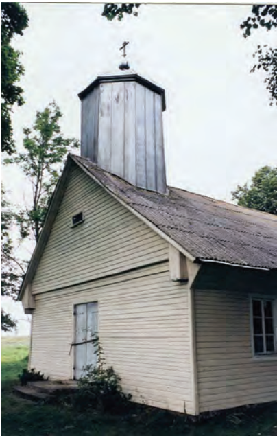
Fig. 27. Sližiškis, Former Old Believer church.