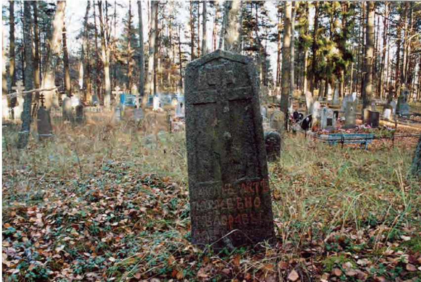
Fig. 68. Davedynai, Monument, datable to 1871.