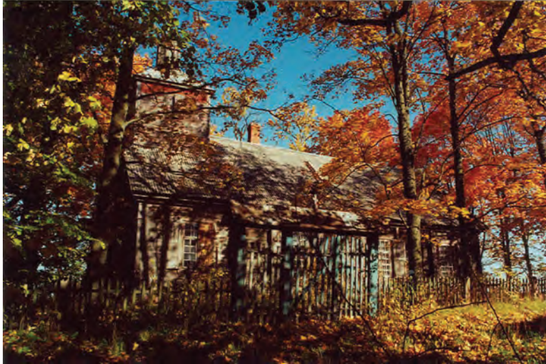
Fig. 46. Aukštakalnis Old Believer church.

Services have not been held for seven or eight years. The church has been emptied out. The building has no windows. It is in danger of destruction. The property around of the church is overgrown with grass and brush. g. Date of survey: September 29, 2000