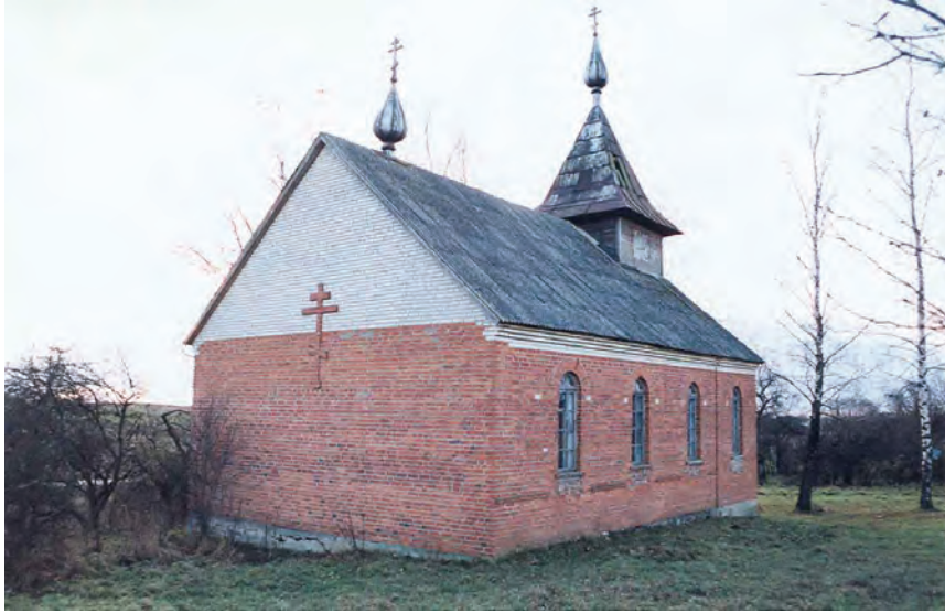
Fig. 7. Dudiškis, Old Believer church.

The Dudiškis parish was founded in 1763. It was one of the first Old Believers parishes in Lithuania. By the end of the 1940s, the parish included about 500 people. The church has not been used since the 1980s or, perhaps, since as early as the 1960s. Local parishioners use the church in Muro- Strėvininkai, some 15 km from Dudiškis.