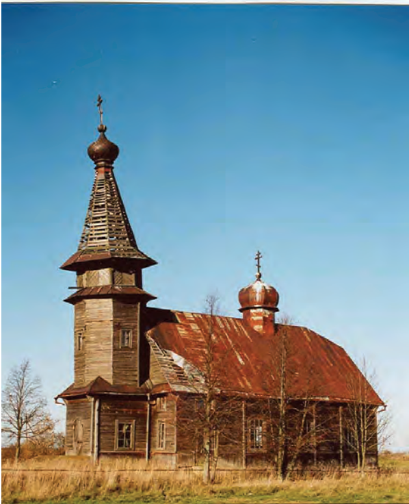
Fig. 72. Jurgeliškės, Old Believer church.