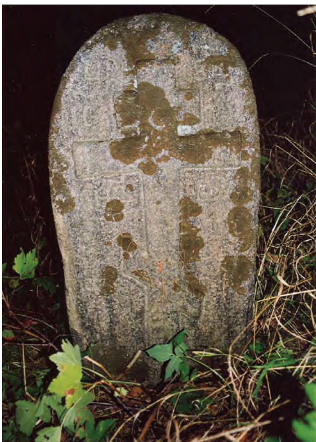
Fig. 13. Perelozai, Unknown gravestone from 18th century in cemetery.