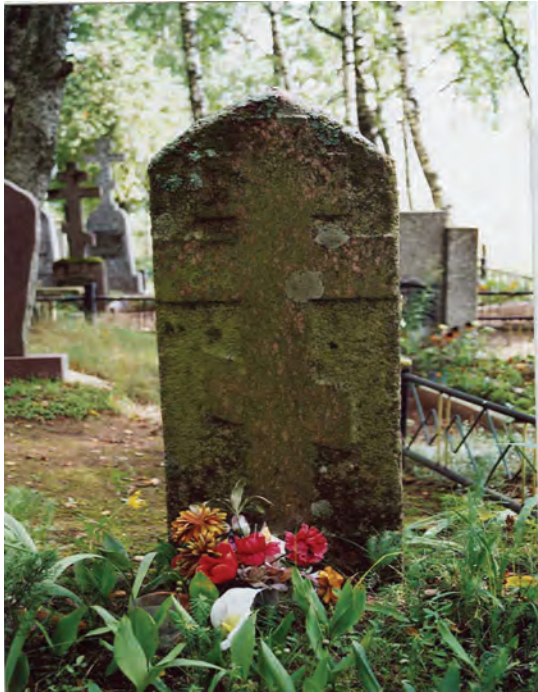
Fig. 31. Juodžiai, Gravestone of an infant from 1919.