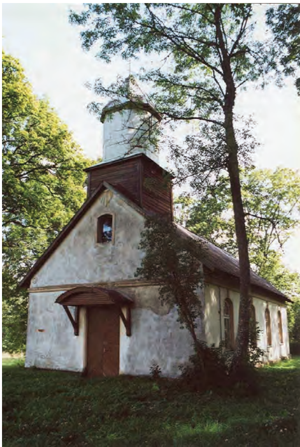
Fig. 35. Juozapavas, Old Believer church.