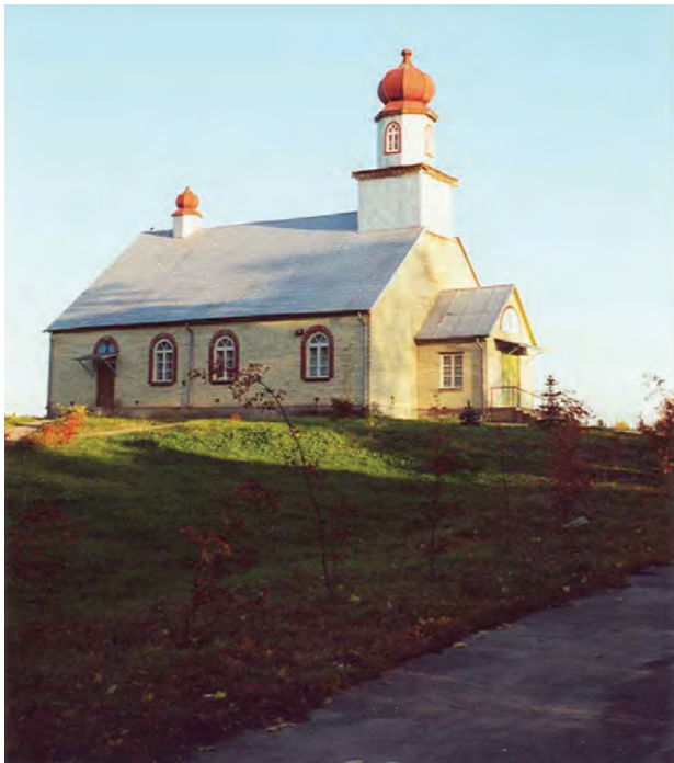
Fig. 39. Zarasai, Old Believer church.