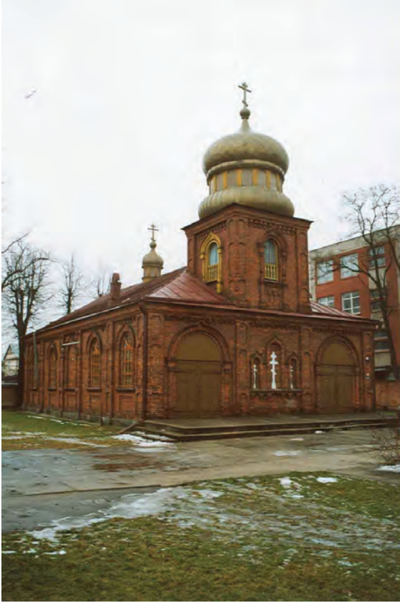
Fig. 8. Kaunas, Old Believer church.