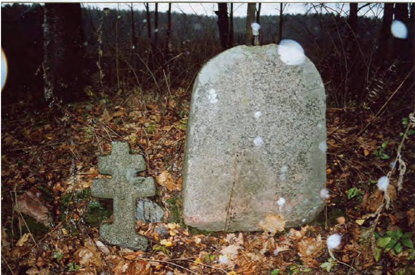
Fig. 77 Daniliškės, Old monument.