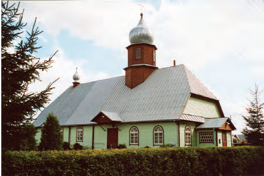
Fig. 44. Utena, Old Believer church.