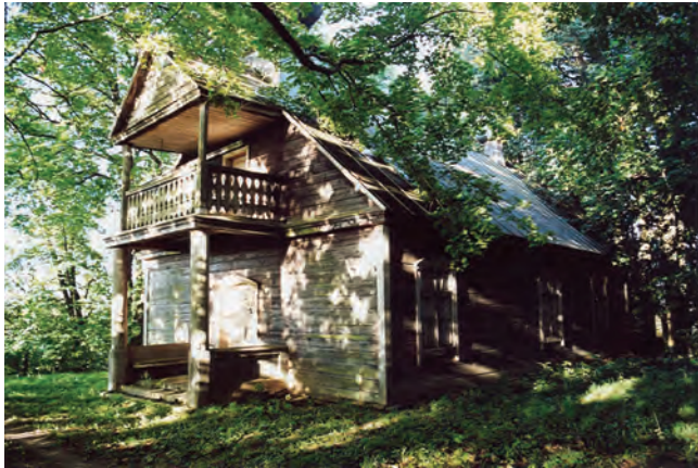
Fig. 22. Bobriškis, Old Believer church.