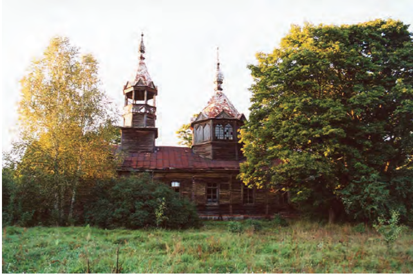
Fig. 6. Perelozai, Old Believer church.

The Old Believer church in Perelozai has special architectural value (and thus is a monument of regional value) because of its use of Old Russian architectural details, such as its church towers and bulb-shaped top, the so-called lukovidnaja glava , with an eight-final cross.