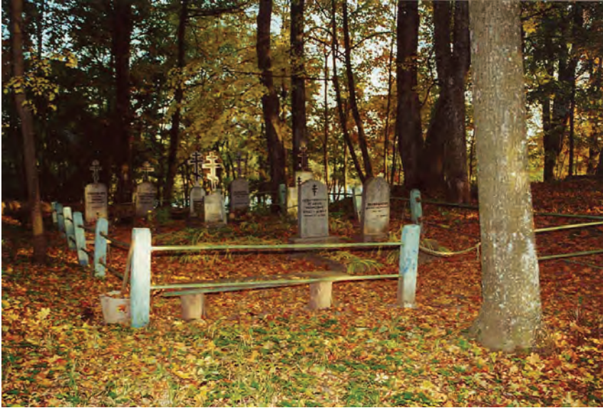
Fig. 54 Samaniai (Barauka), Graves in the eastern part of the cemetery.