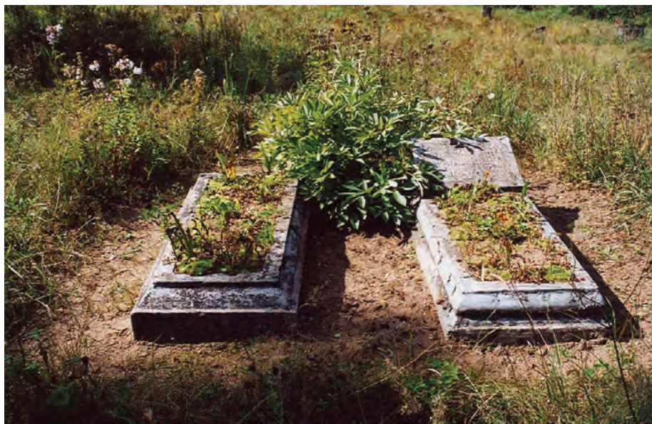
Fig. 37. Kontaučiai, Cemetery. Inscription reads: “They were killed by the hand of the bourgeois nationalists. 20 10 1947.”