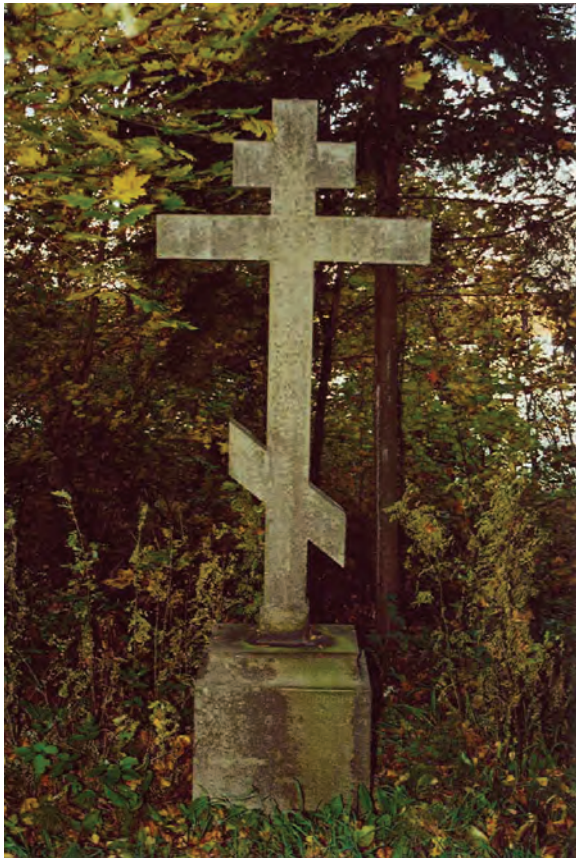
Fig. 59. Aleiniki, Major eight-final cross in the cemetery.