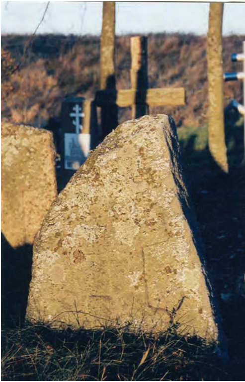
Fig. 81. Videšiūniškės, Old monuments, one with an eight-final cross is visible.