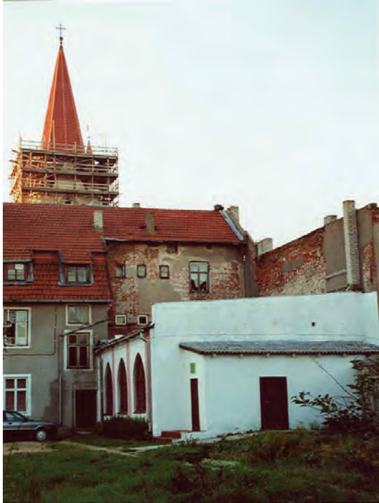
Fig. 17. Šilutė, Old Believer church.