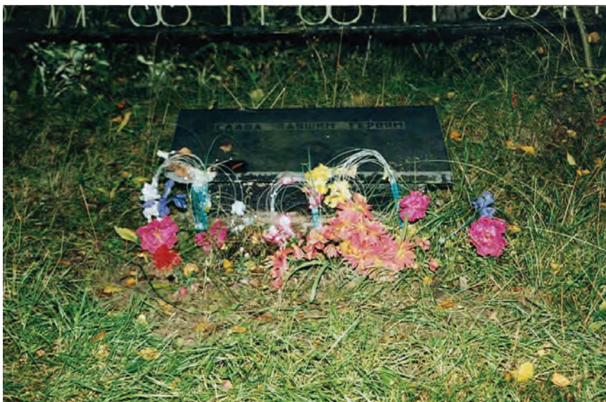
Fig. 12. Perelozai, Gravestone in cemetery.