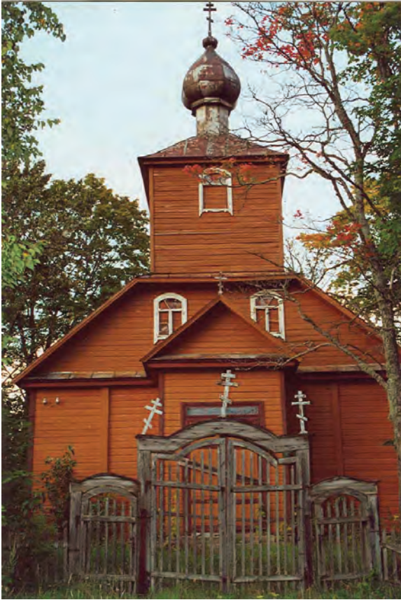
Fig. 40. Raistaniškis, Old Believer church.