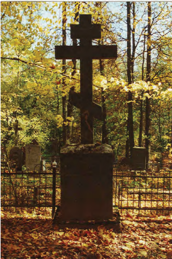
Fig. 70. Aukštakalnis, grave of spiritual leader Maksim Rybakov (d.1911).