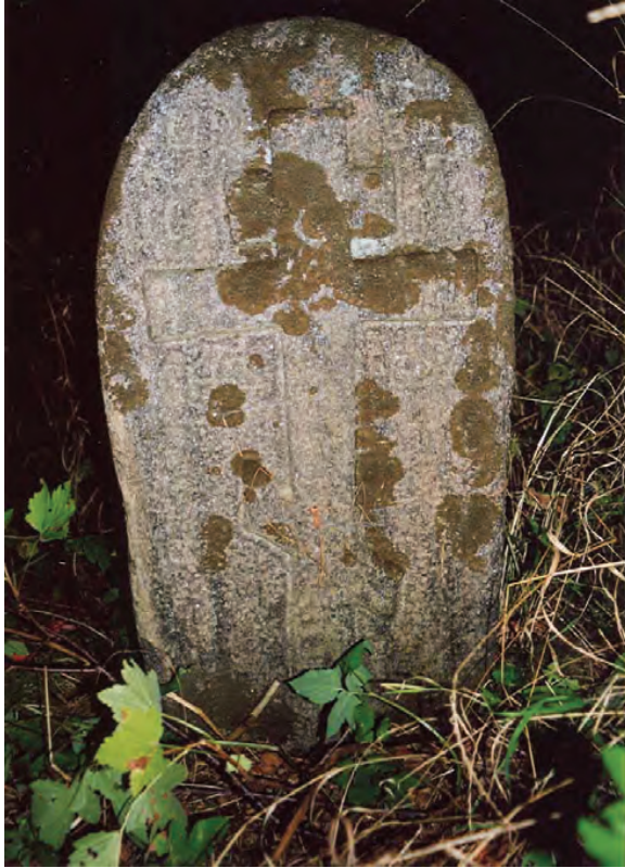
Fig. 62. Šventupis (Svetorechje), Gravestone for Agaphija Ivanovna (d. 1847).