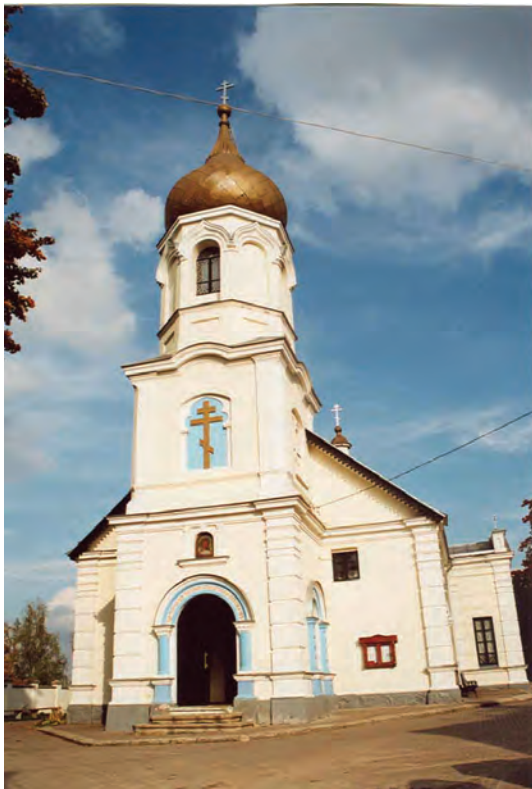
Fig. 71. Vilnius, Old Believer church.