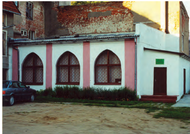
Fig. 18. Šilutė, Old Believer church.