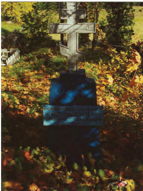
Fig, 58. Rudancy, Perhaps the oldest Old Believer cemetery in Lithuania.