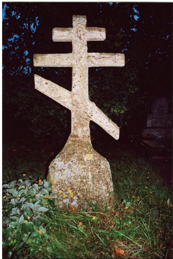
Fig. 4. Nekrūnai, Old gravestone in Cemetery.