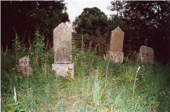
Fig. 24. Vaboliai, Neglected gravestones in the Old Believer cemetery.