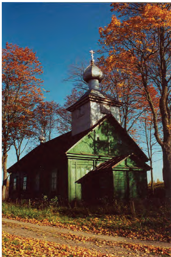
Fig. 42. Minovka, Old Believer church.